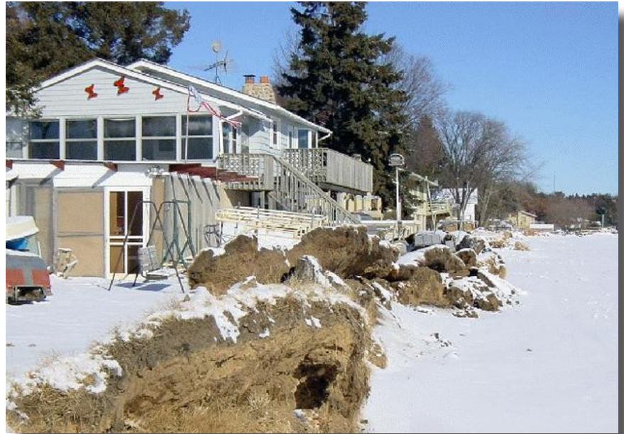
Ice ridge formed along the shore of Shamineau Lake in Morrison County.

Property owners occasionally return to their cabins in the spring only to discover they are dealing with property damage caused by a phenomenon called "ice heaving" or "ice jacking". This powerful natural force forms a feature along the shoreline known as an "ice ridge". The result may include significant damage to retaining walls, docks and boat lifts, and sometimes even to the cabin itself.