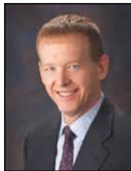
Mayor Mike Myser

But instead of being discouraged, it is important to lay the foundation for growth for the future of Prior Lake. I believe