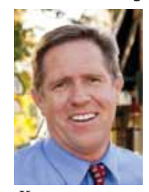
KIRT BRIGGS MAYOR